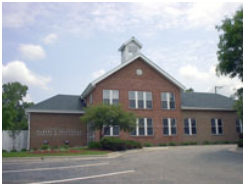
The Reynoldsburg Compact on Respect

Occasionally a meeting will need to be moved to an alternate location. Notice of any change of location and time will appear in the local newspapers.